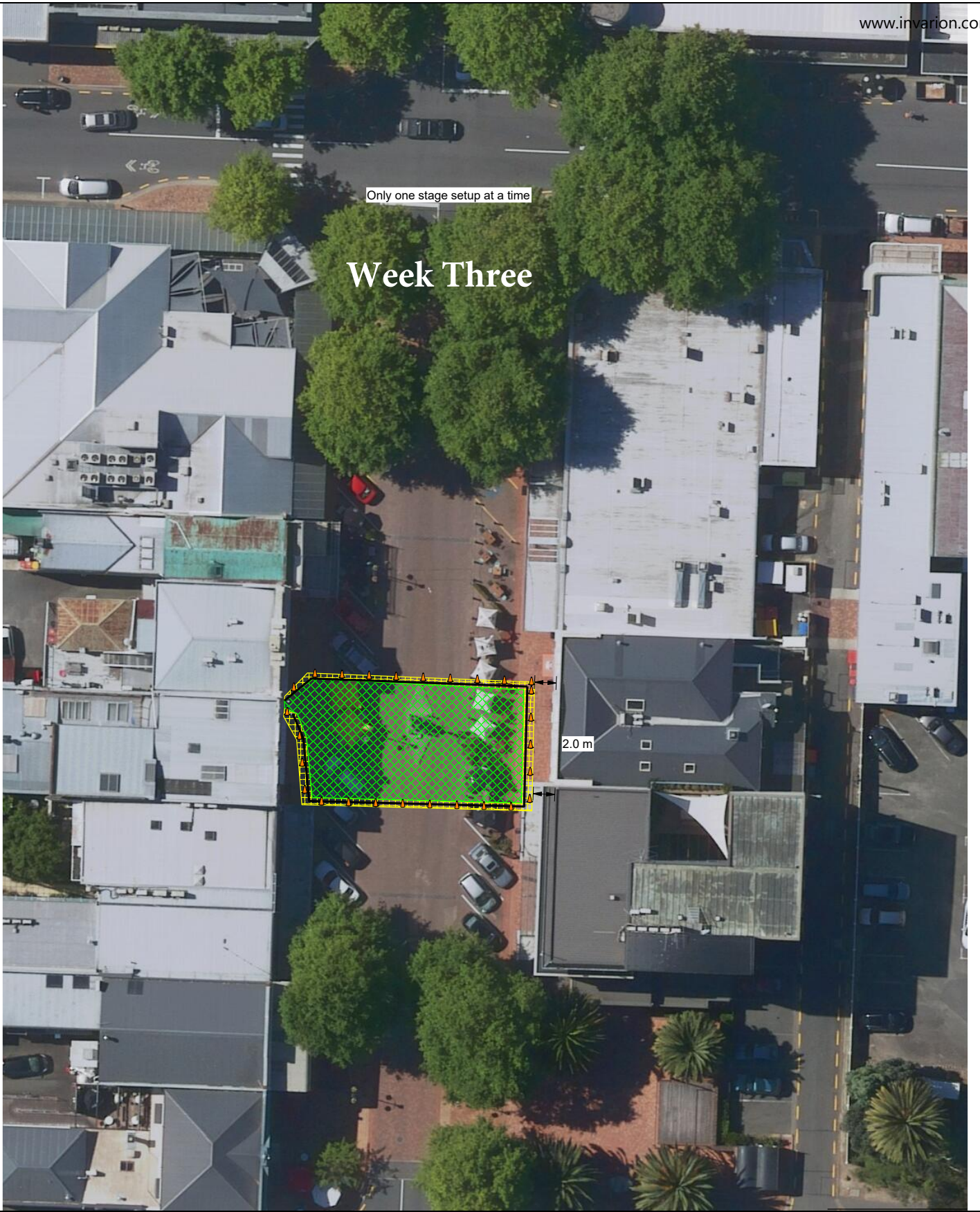
Upper Trafalgar Street construction programme