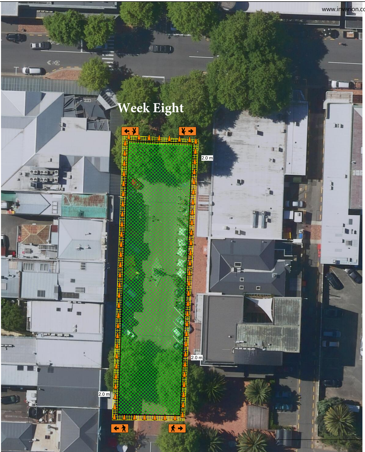
Upper Trafalgar Street construction programme