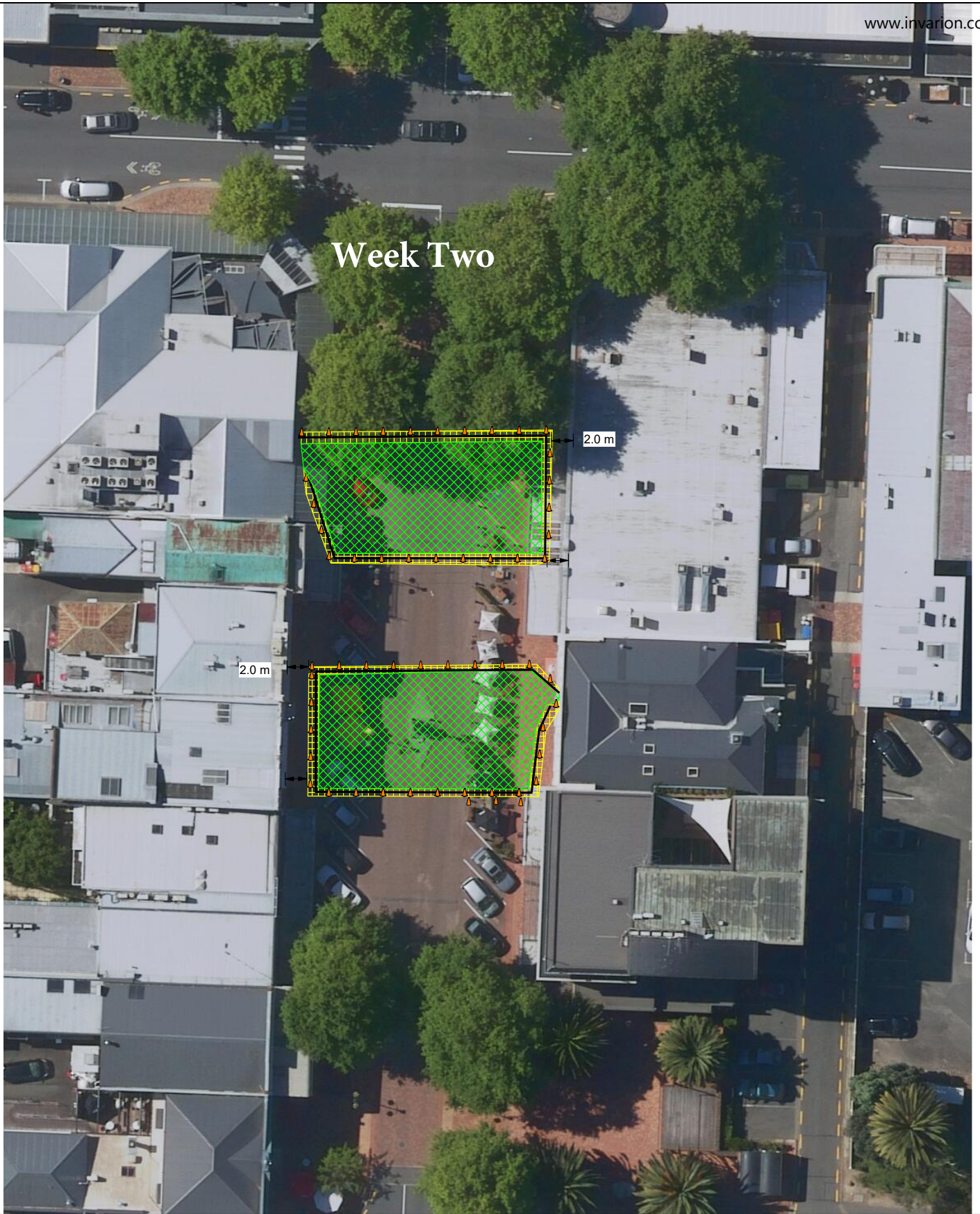
Upper Trafalgar Street construction programme