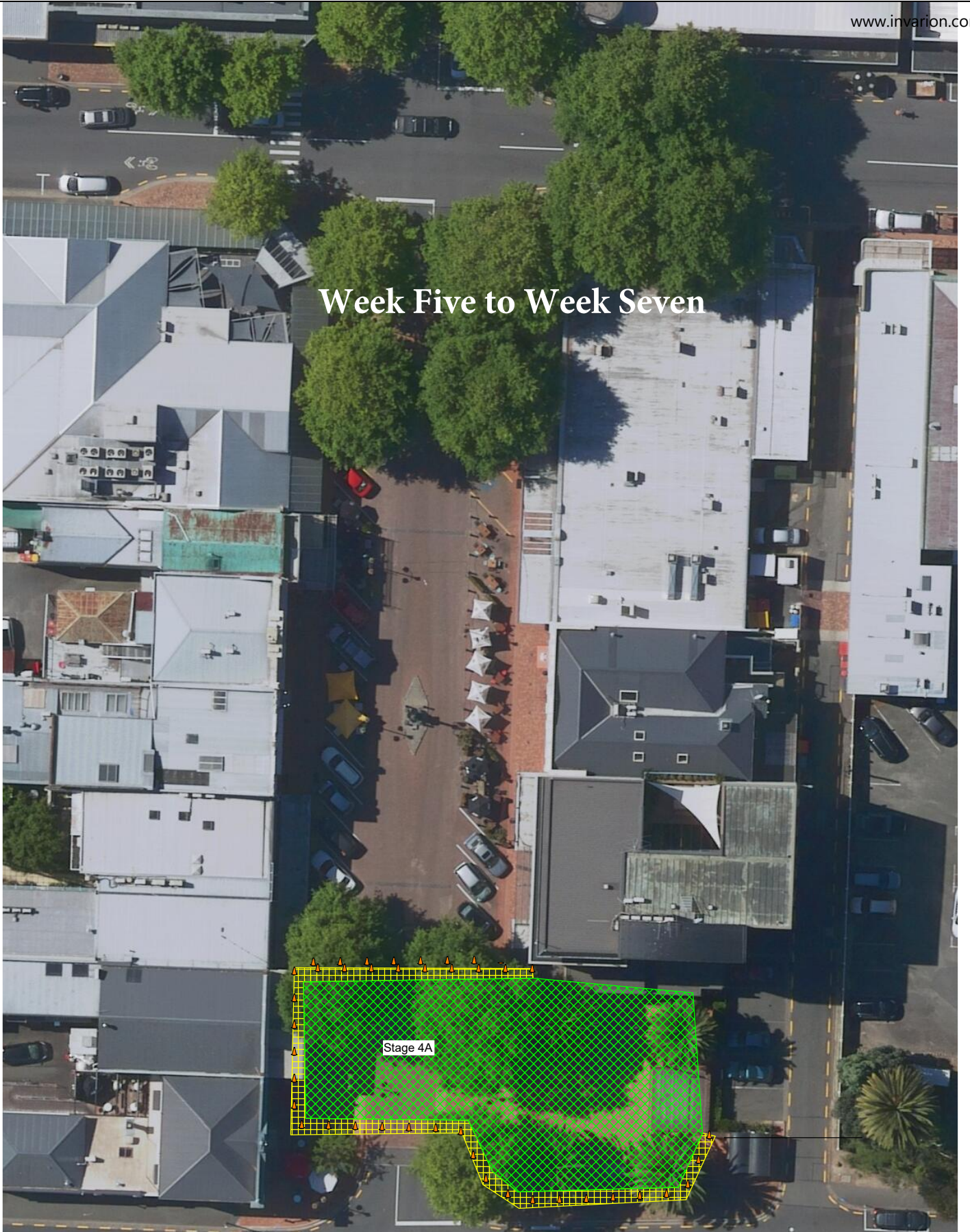
Upper Trafalgar Street construction programme