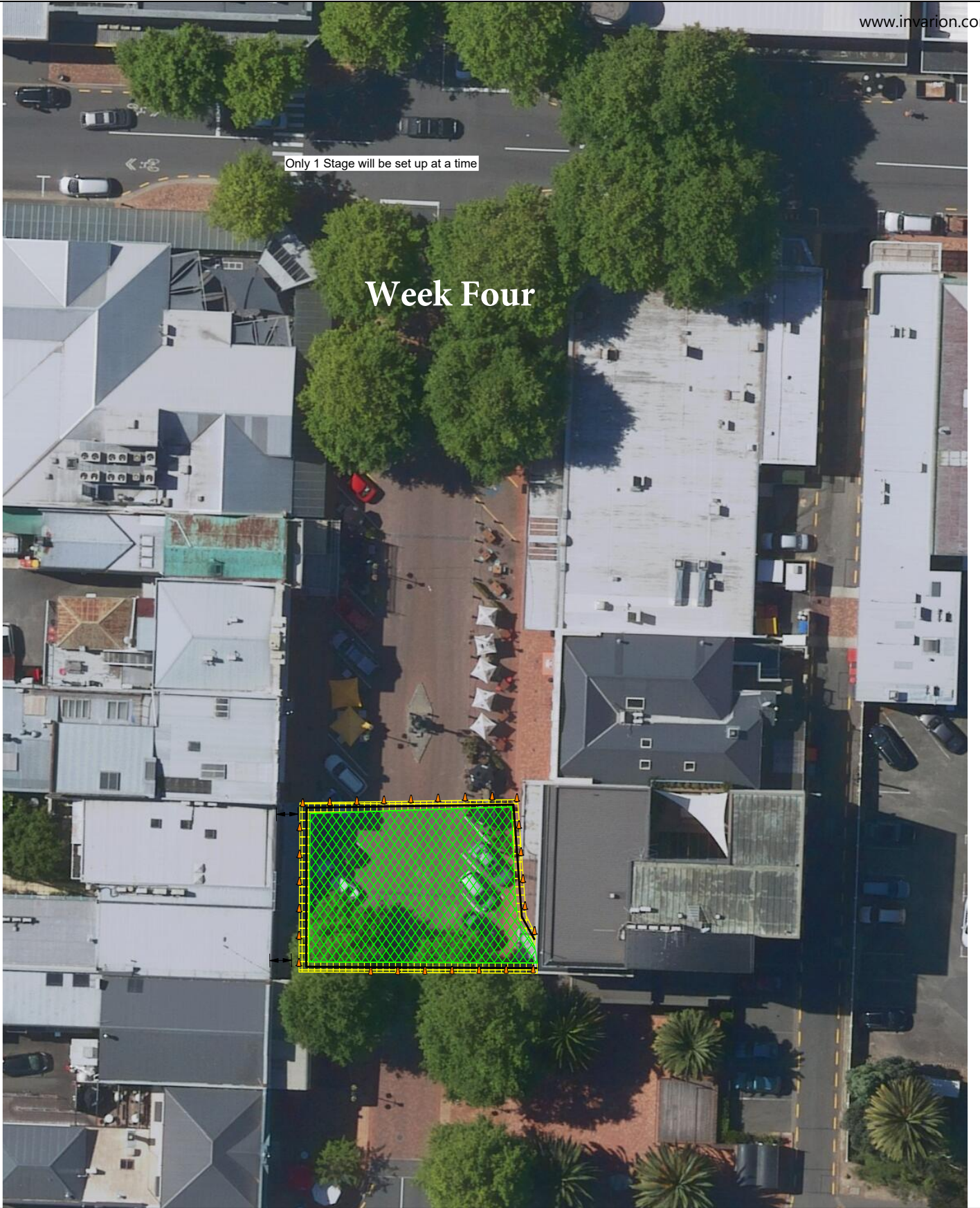
Upper Trafalgar Street construction programme