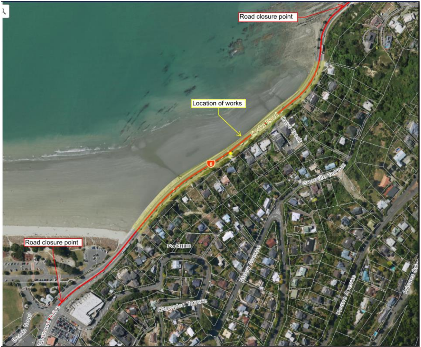
Aerial map of location of works & road closure points: State Highway 6, Rocks Road